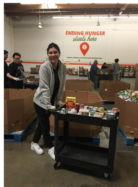
Feeding America Riverside | San Bernardino