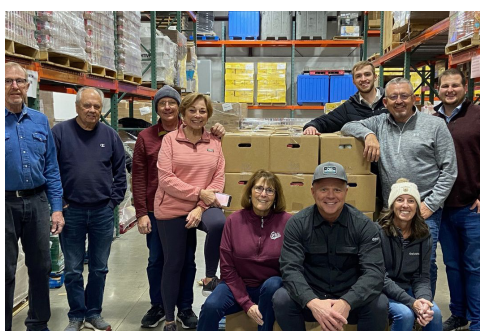
Montana Food Bank Network