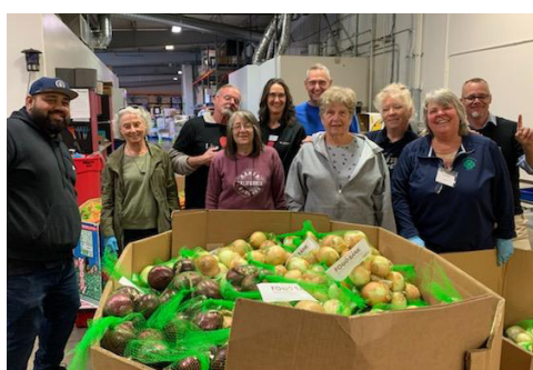
Placer Food Bank