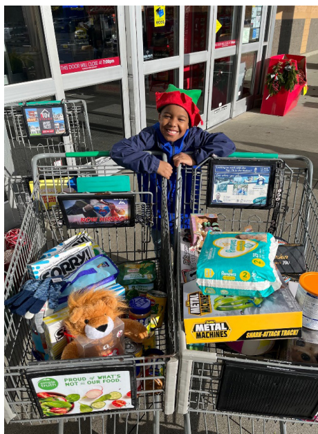
Volunteers of America Western Washington