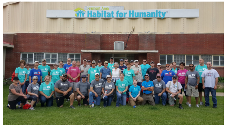
Members from Columbus, Lincoln, and everywhere in between provided flood relief in Fremont, NE.

The blankets and snack sacks were delivered to Glenwood & Tabor, Iowa's distribution sites, providing relief to persons affected along the Missouri River.