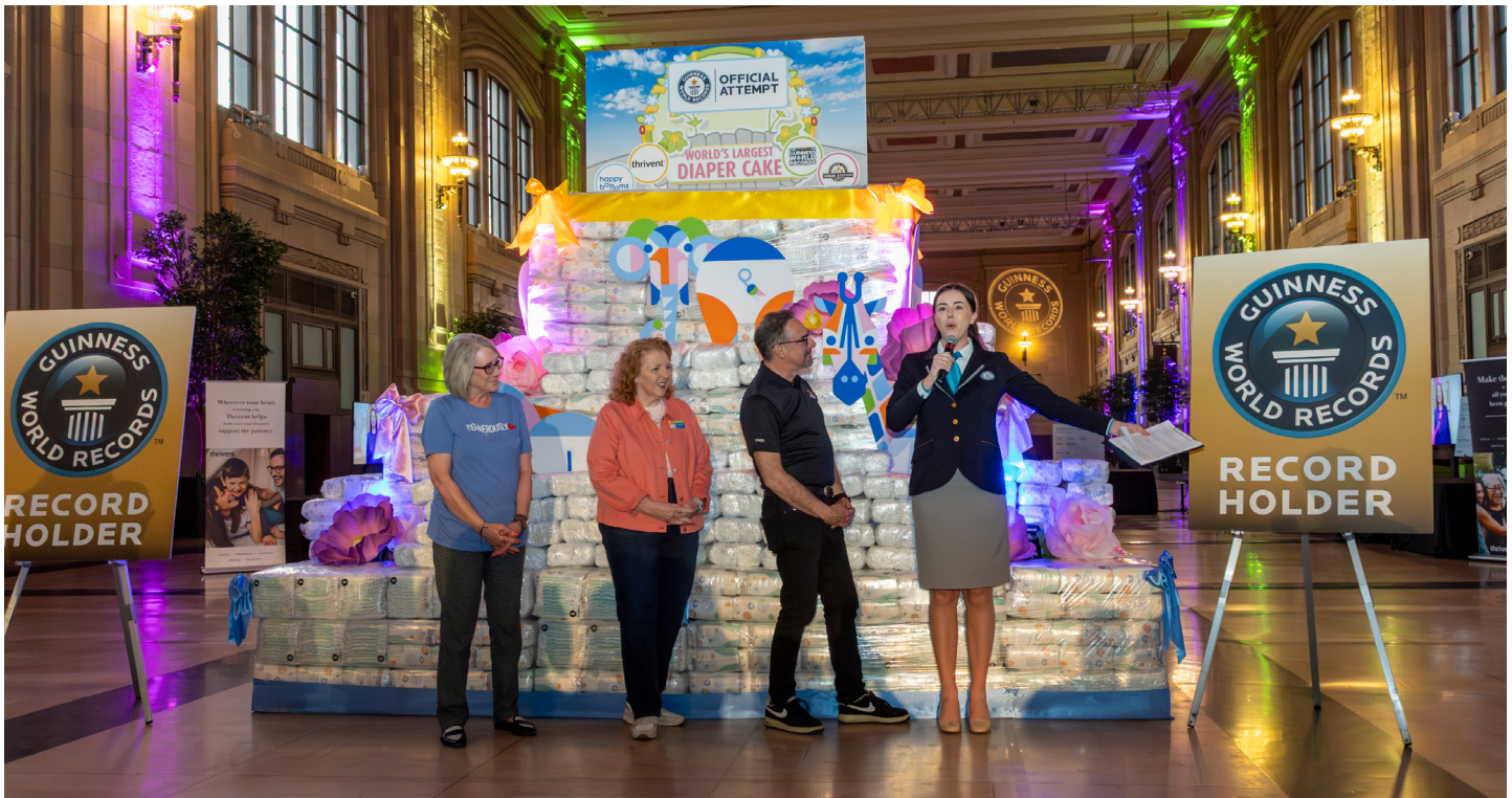
The final announcement is made—we officially broke a Guinness World Record!