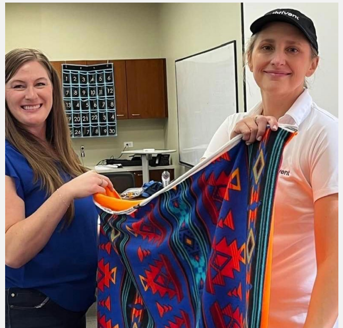
K and Hutch