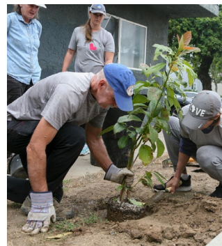
Love Costa Mesa Serve event volunteers.