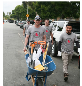
Love Costa Mesa Serve event volunteers.