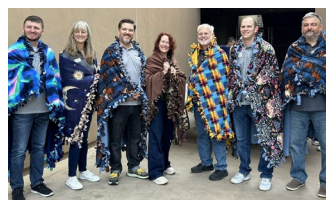
Our team at Love Irvine.