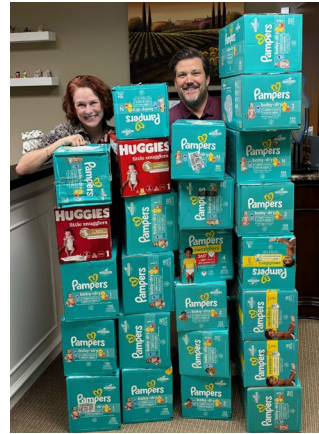
Diaper Drive donations.

The impact of Hurricane Helene stretches from Florida's Gulf Coast to the Appalachian Mountains in Virginia, and recovery is expected to take months (or longer) for some communities. Thrivent has quickly activated our generosity programs to drive impact and support those in need.