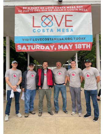
Love Costa Mesa Serve event volunteers.