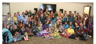
Love Orange volunteers.