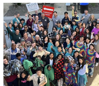
Love Irvine volunteers.