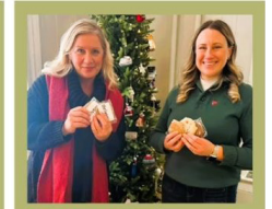
Highlights from our first year

Thank you for being part of our journey. We look ahead with gratitude for what's been and excitement for what's to come.