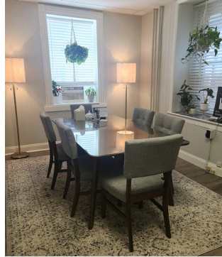
Welcome to our table

Our door is always open, and so is our commitment to the people and communities we serve. Whether you're stopping by our office on Mauch Chunk Street or connecting with us virtually, our focus remains the same: offering personalized financial guidance rooted in your values, your goals and what matters most to you.