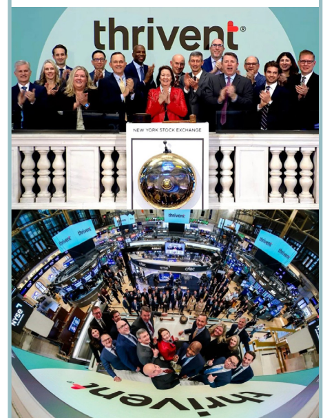
Thrivent rings bell at New York Stock Exchange, January 2026

In January, Thrivent's leaders visited the New York Stock Exchange to ring the closing bell, marking the end of the second trading day of the year. This was the first bell-ringing ceremony for Thrivent and a proud moment for the organization and its community.