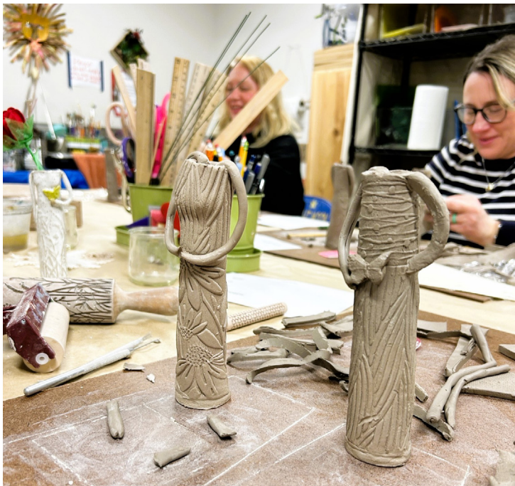
Vase-making in action

Events like these allow us to connect in meaningful ways while inviting friends and family to learn more about Thrivent in an authentic, no pressure environment.