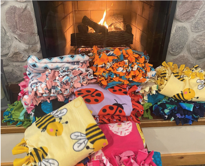
Pictured above: No-sew blankets were assembled fireside.

winter day to make blankets while enjoying each other's company. After the blankets were assembled, they were delivered to Bronson Children's Hospital to bring comfort to hospitalized children.