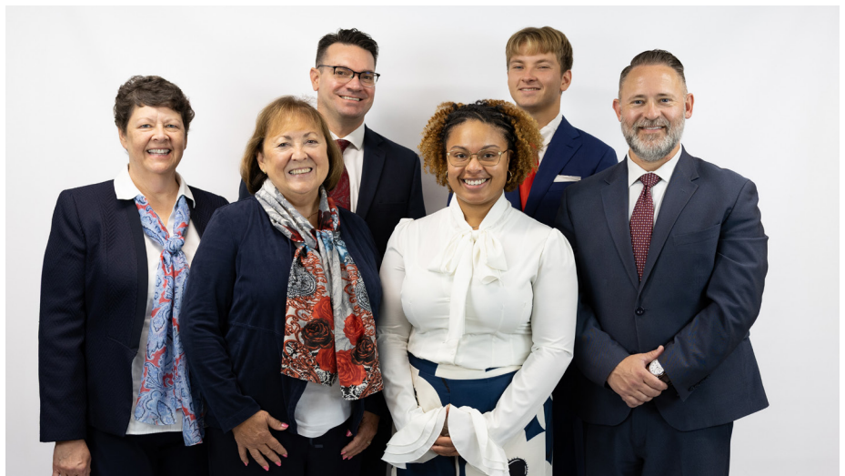
Our Legacy Consultant Financial Advisors

Welcome to our first team newsletter! We are excited to bring you updates about our team, Thrivent Community events and recaps, timely news and more.