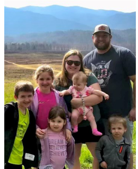
Lawson family on Spring Break

Of course, all that relaxing must be countered with spontaneous adventures. While the winter months keep us confined indoors, summer beckons us to experience the freedom and deliciousness of the open outdoors. Camping trips in the RV are one activity that my family truly enjoys. The children like to help with the packing, but they tend to forget things like pajamas