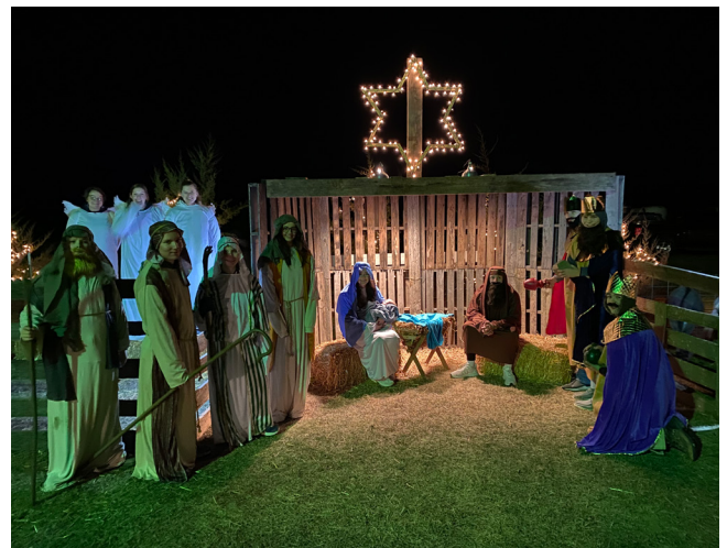
Live nativity volunteers at Trinity Lutheran